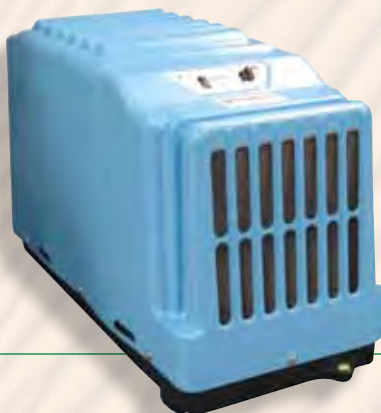
SaniDry™ Model CSB