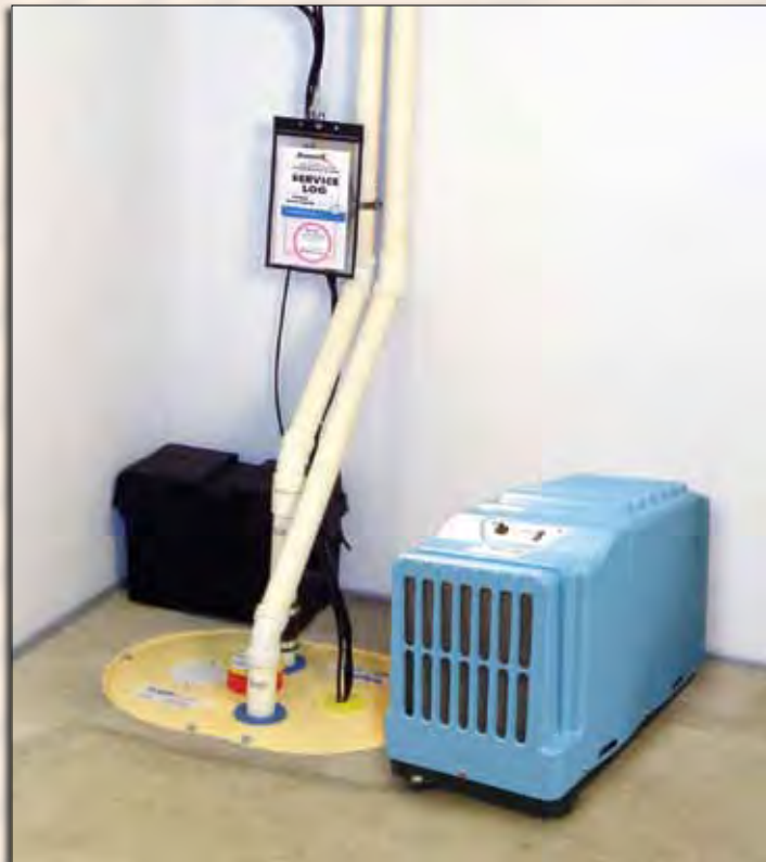
SaniDry™ CSB with a TripleSafe™ sump system, WaterGuard® and BrightWall® in a basement.

The SaniDry™ Model CSB will dry the air (up to 6000 square feet, 3 feet high) in your crawl space or basement and automatically drain the water so you never have to empty it.