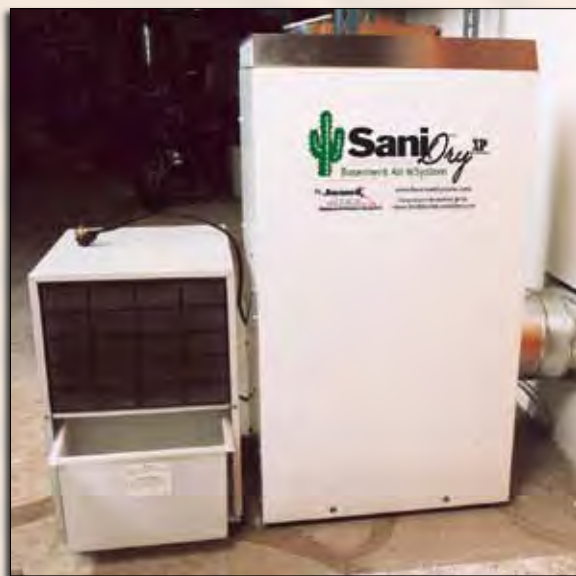
SaniDry™ XP shown next to a smaller household dehumidifier that just can't keep your basement as dry as you want it!

If there is no way to drain SaniDry™ XP in your basement by gravity, a condensate pump (shown to left) can be installed to drain the water out of your home.