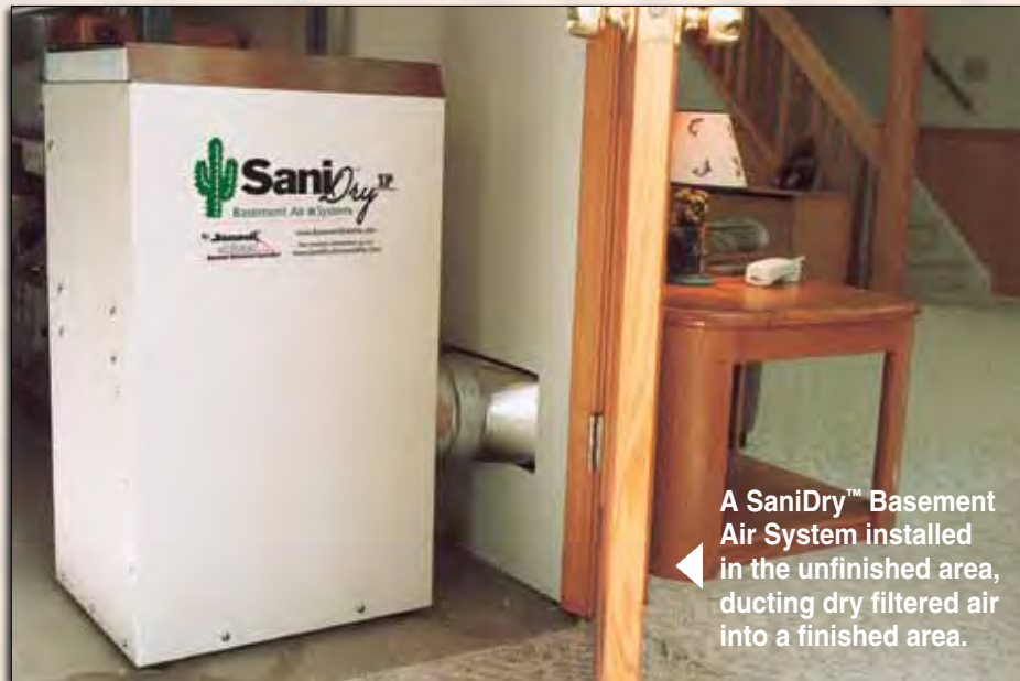
A SaniDry™ Basement Air System installed in the unfinished area, ducting dry filtered air into a finished area.

SaniDry™ XP Basement Air System is a powerful and effective dehumidifier – big enough to do the job. It will dry the air and automatically drain the water out of a hose, so you never have to empty it, like a conventional dehumidifier. The SaniDry™ XP will take four times the water out of the air as a typical dehumidifier, yet uses the same energy.