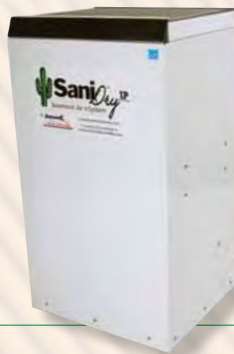
SaniDry™ XP Upright Model